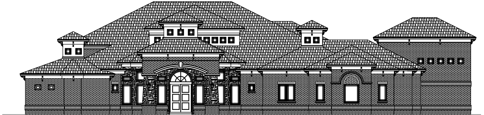
FRONT ELEVATION @ MAIN HOUSE