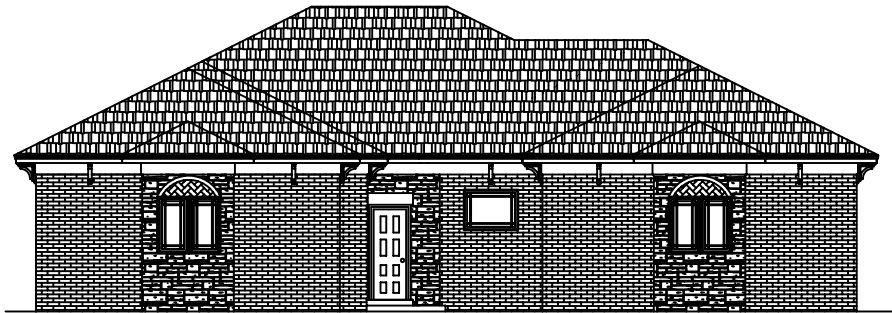
FRONT ELEVATION @ GUEST HOUSE